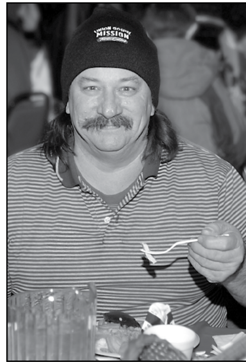
A hot, nutritious meal at the Mission reminds homeless people that friends like you really care — and God cares!

Please be as generous as you can this holiday season. So many people need your help. Thank you.