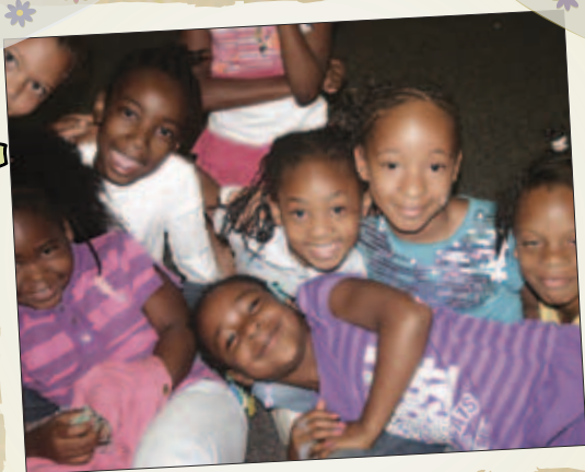
Best friends forever! These are the girls that prayed with me.

"First thing I'm gonna do when I get home is ask Mom if I can come back next year."