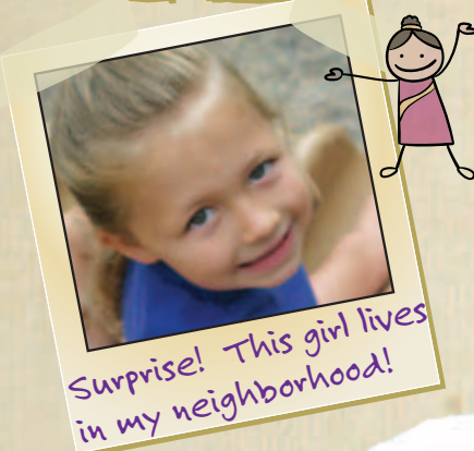
Surprise! This girl lives in my neighborhood!