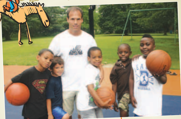
Nobody can beat this team!

"I can always find something fun to do."