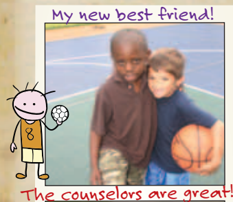
The counselors are great!

"I can always find something fun to do."